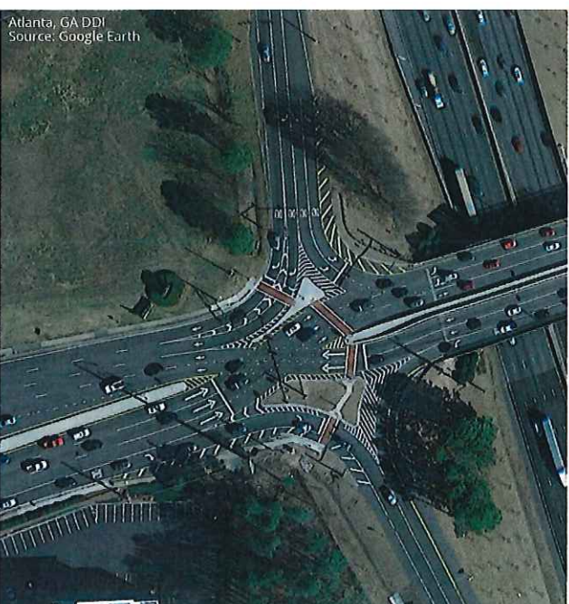
Atlanta, GA DDI

AN INNOVATIVE, PROVEN SOLUTION FOR IMPROVING SAFETY AND MOBILITY AT INTERCHANGES