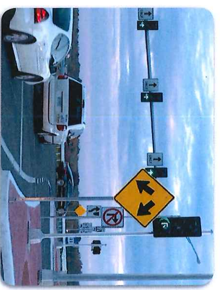
Springfield, MO DDI

Opened in 2009, the DDI in Springfield (Missouri) was the first in the United States. Since then, dozens more have been built in several states, and they have quickly become a popular interchange design option. Where they have been built, travelers save time, agencies saved money, and communities will benefit from safer facilities for many years.